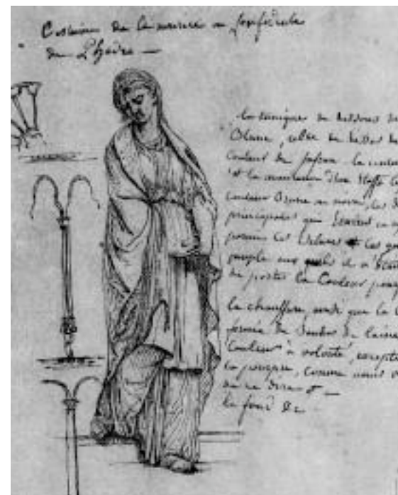
Costume study for Phèdre’s nanny, Jean-Jacques Lequeu